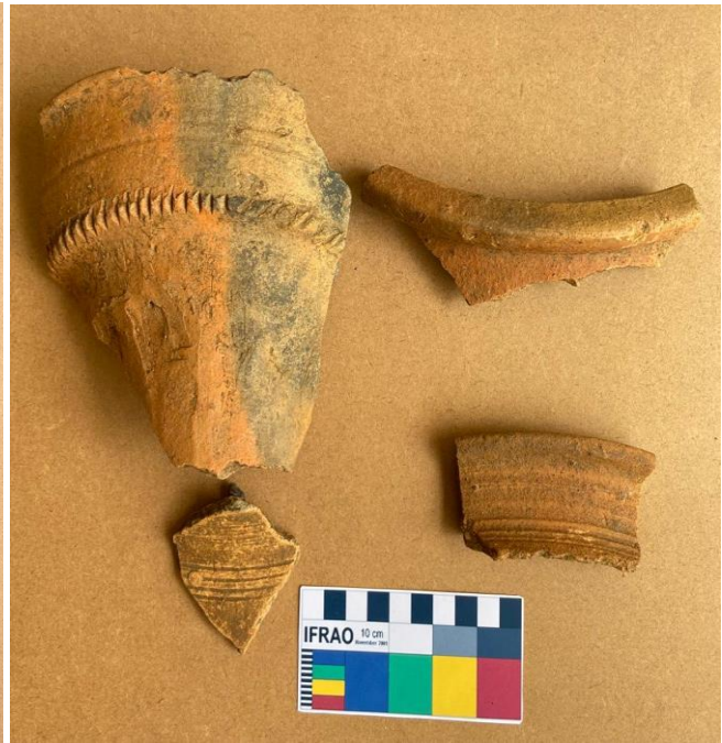
Figure 3: Red ware with decoration at Ralabagarh