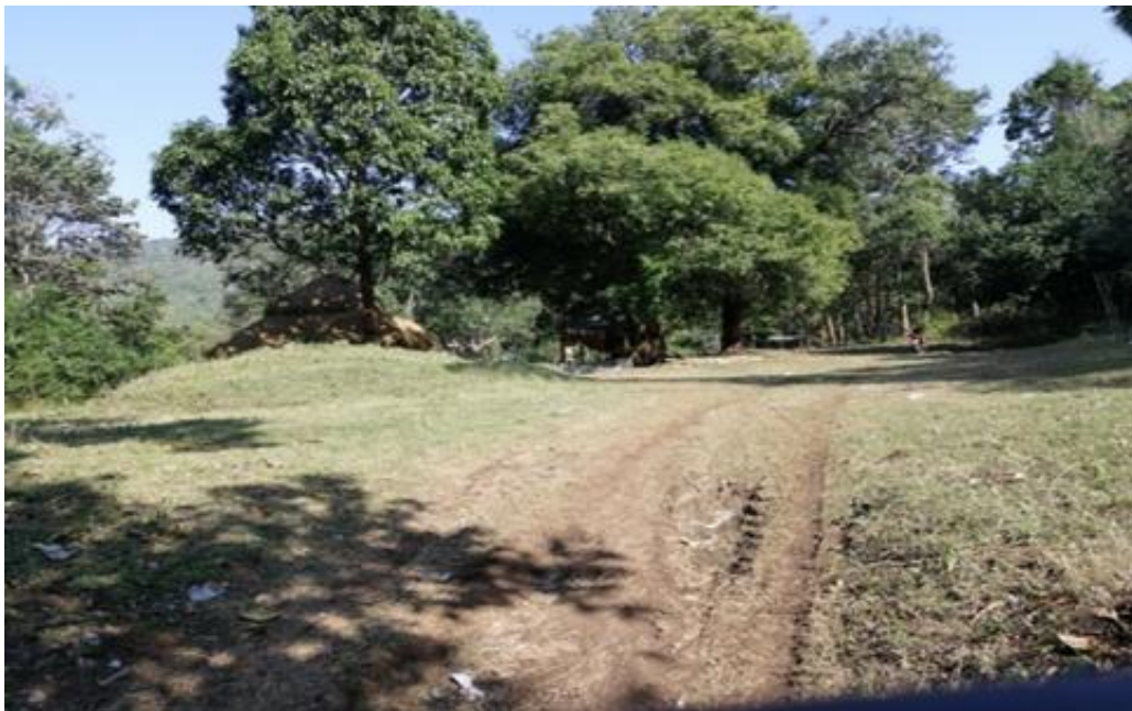
Figure 1: Ralabagarh Mound