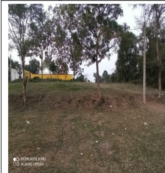
Figure 7: Asuradhipa Mound