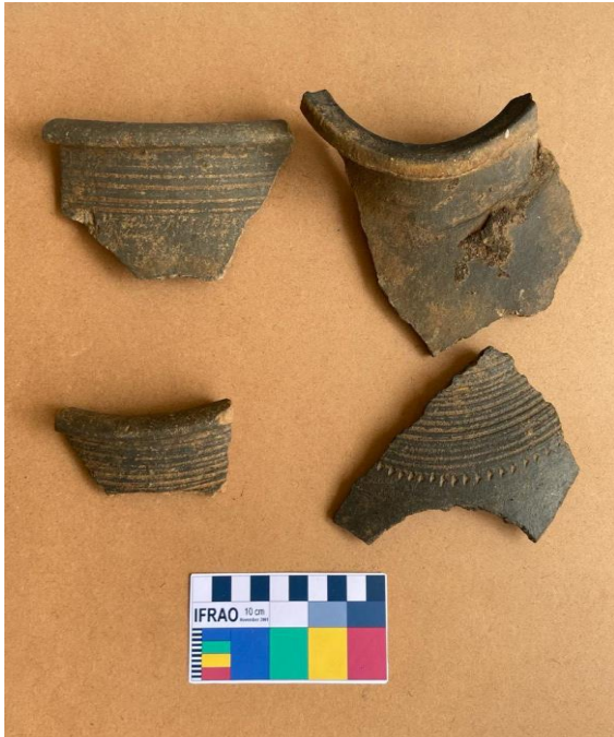
Figure 2: Black wares with decoration at Ralabagarh