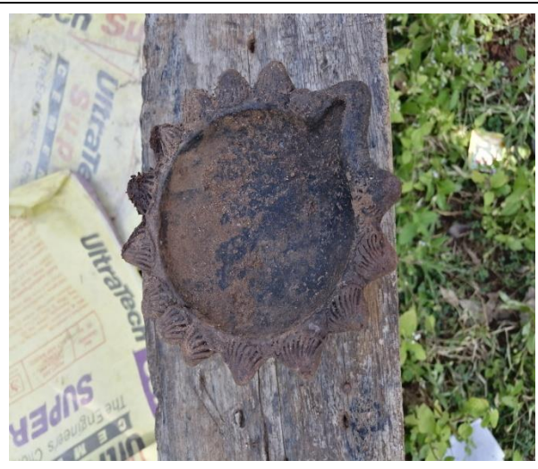
Figure 6: Terracotta Lamp