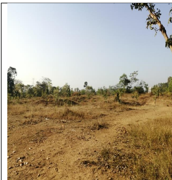
Figure 9: Paikabankatara Mound