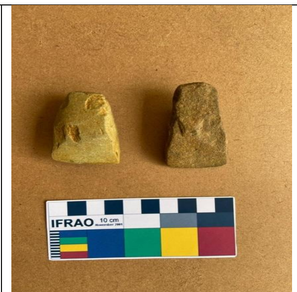
Figure 10: two chisels