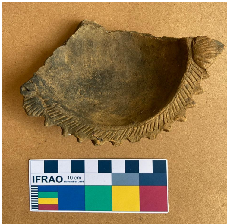
Figure 4: A fragmented of terracotta lamp