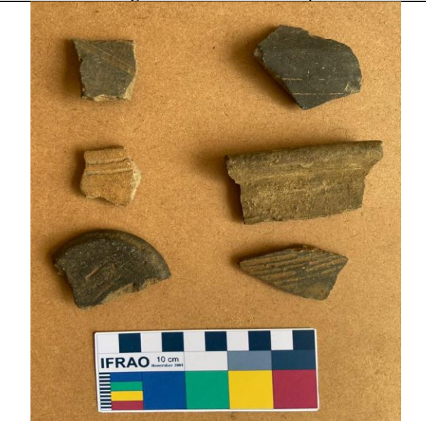
Figure 8: Decorated Sherds