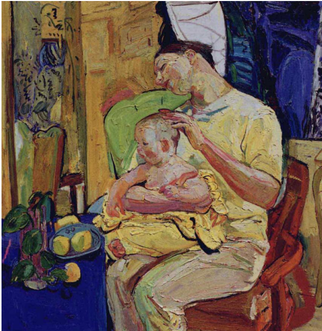
Figure 4: Mother and child, 2001

brightness, purity and intensity. Colour blocks with such a strong degree of contrast can quickly catch the viewers' eyes and attention, creating the aesthetic pleasure of colour collision and bringing a certain degree of psychological disparity. Together with the reasonable position arrangement, it makes the whole picture jump and harmonious. Yan Ping's use of colour language on the one hand reflects her meticulous feeling of life and keeps it as vivid and original as possible, and on the other hand also reflects her research and mastery of Western Nabilism and Impressionism. (Figure 4)