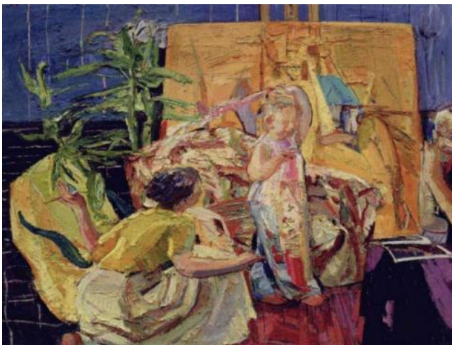
Figure 2: Mulan