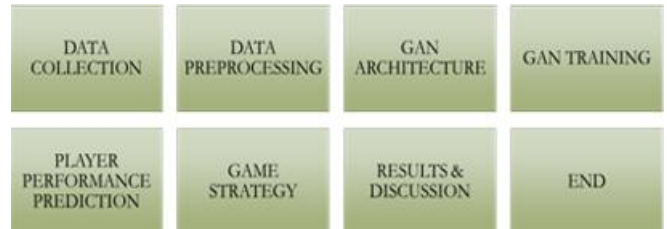
Figure 1 (a)