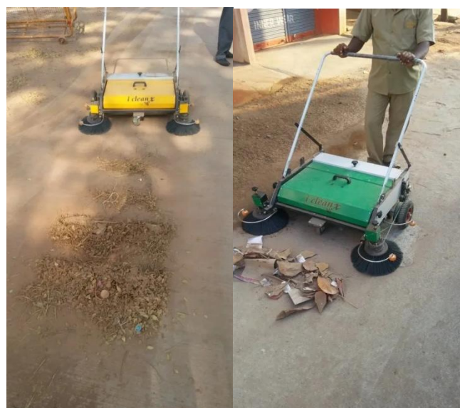
Figure 9: i-clean X- A manually operated machine being used to sweep roads

A good example of a semi-manual machine that can be considered is a grass cutting machine. There are also many existing semi-manual sweeping machines that should be employed instead of using sweeping brooms which became orthodox and disadvantageous in more ways than one. One such example is the i-cleanX machine being produced by Triangle Innovations. The machine is used in several wards of the Bangalore Municipality and uses green technology instead of fossil fuels. The machine is designed in such a way that manual intervention is necessary only to push the cart.