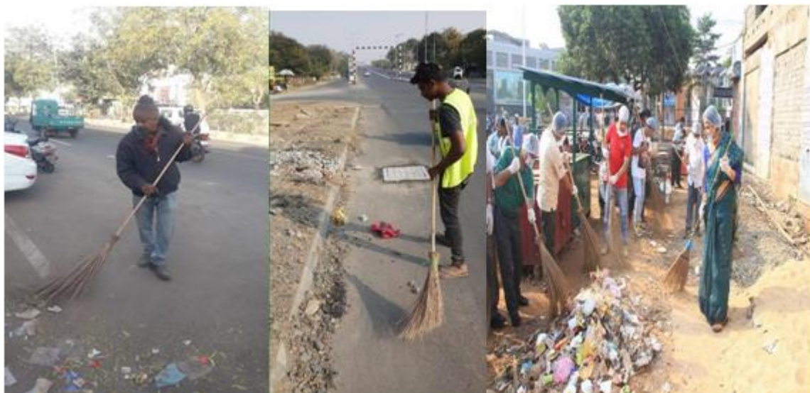
Figure 1: Types of solid waste generated in typical Indian cities

Solid Waste management (SWM) involves collection, transportation, deposit and treatment of wastes making street cleaning an integral part of SWM. These wastes are cleaned and collected using various street cleaning techniques. Even with intensive cleaning techniques and frequencies, the roads are still not clean and we can still visibly see littering and garbage everywhere. To deal with this issue, the central government of India came up with the Swachh Bharat Mission in 2014 to achieve universal cleanliness and sanitation covering all divisions of Indian roads from villages, towns and municipalities. A part of it is making people aware of the importance of cleanliness, hygiene and health, and providing necessary sanitation facilities including solid waste disposal systems. With fewer and fewer people interested in doing lowly paid jobs such as street sweeper, the civic authorities have to depend on machines for cleaning the streets to meet the sanitary needs of the population as cleanliness also contributes to greater general public health.