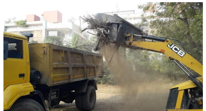
Figure 7: JCB bobcat emptying into collecting van

The sweeper is operated once per day frequency right after the manual sweeping is done and usually gets emptied into a