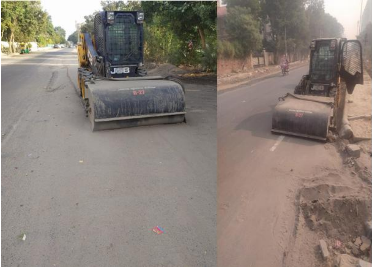
(i) (ii) Figure 5: JCB Bobcat Sweeper (i,ii)

with the help of a long cylindrical brush and a dust collector that is placed beside the cylindrical brush.