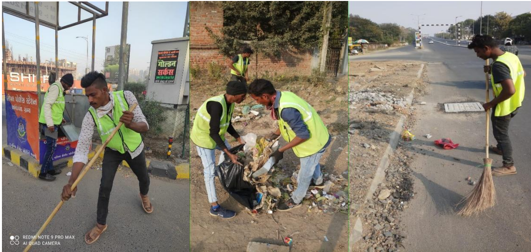
Figure 3: Manual sweeping being done on various roads in the ward

AMC sources most of its street cleaning requirements through manual sweepers only. It employs a total of 1500 manual sweepers throughout the 48 wards present in the municipal corporation. The Chandlodia ward where the research was conducted employs 224 manual sweeping labor.