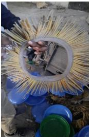
Figure 6: Brush of JCB sweeper

landfill or a dust collecting van. The vehicle runs on diesel and has a capacity of 460 liters/0.46 Cubic Meters.