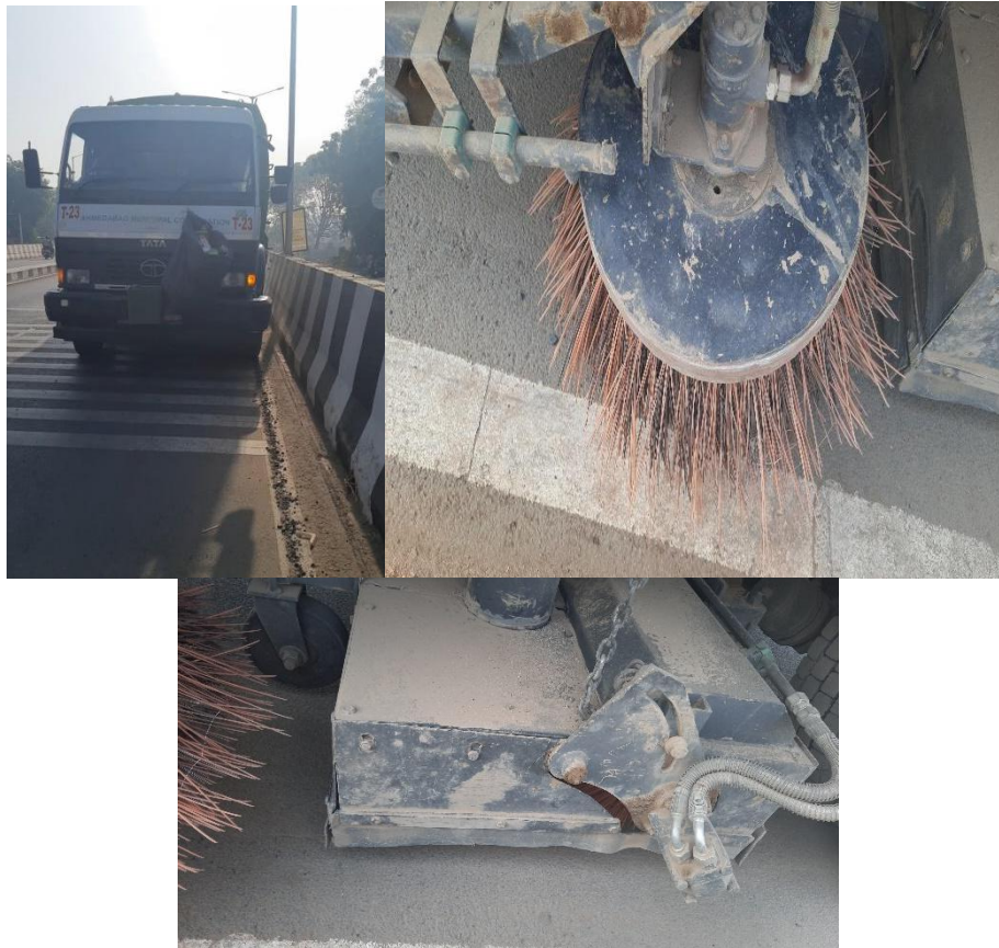
Figure: 8 TPS Sweeper

The TPS sweeper is operated by two people, a driver and an assistant. It is operated at a speed of 5-10 km/s in order for it to operate at maximum efficiency. This machine comes with a meter of sweeping area and an overall width of 1.89 meter. TPS also comes with a brush that is a combination of steel and polypropylene.