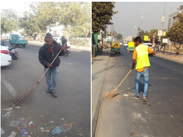
Figure 4: Brooms used for manual sweeping

The sweepers in AMC use only one main type of broom for sweeping the roads which looks like this: