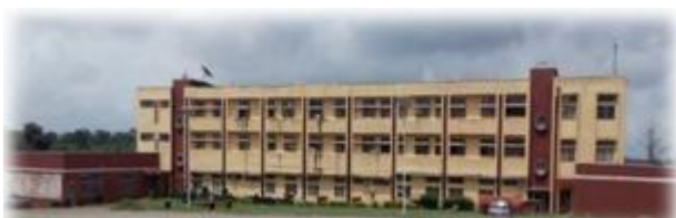
Plate 1: Atypical view of School of Engineering and Engineering Technology