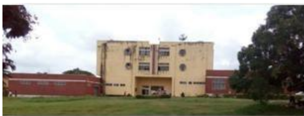
Plate 2: Approach view of the School of Engineering and Engineering Technology

in built environment, building owners, contractors to identify various retrofitting measures for upgrading existing buildings in order to improve thermal comfort and improve energy efficiency within the building.