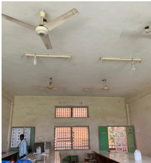
Plate 3: A typical laboratory in the faculty of engineering FUTA, cooling system employed include fans, lamps, louvered windows and high-level head room