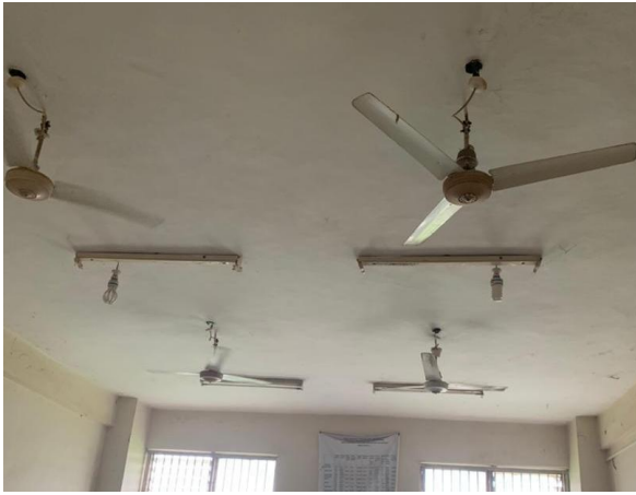
Table 4.3: lamps, bulb and high-level windows as lighting fixtures used the building