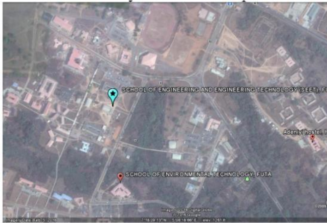
Figure 1: Location map school of engineering and engineering technology FUTA