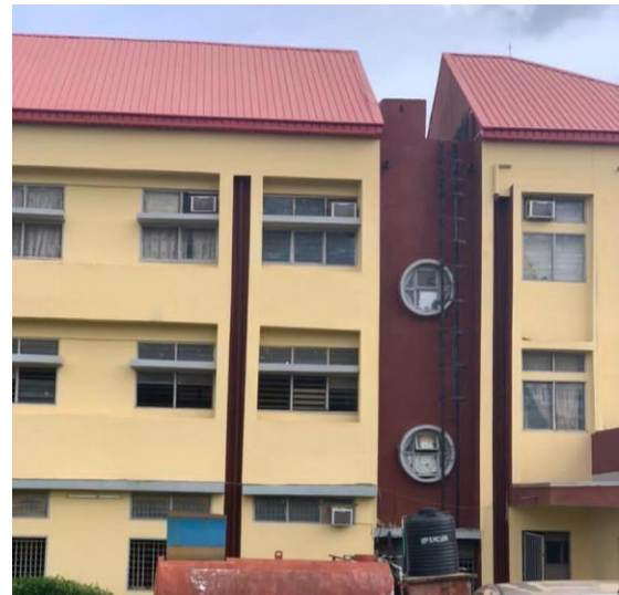
Plate 4: Use of vertical and horizontal fins on the building exterior as a shading device to improve cooling within the faculty building