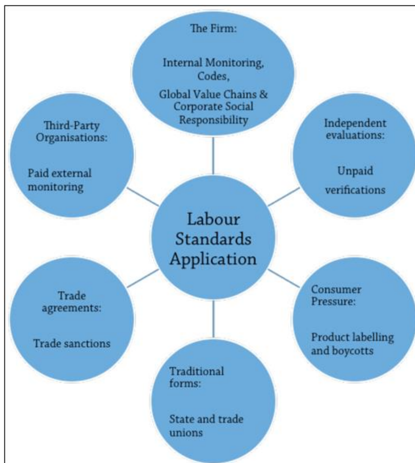
Figure 2: Various mechanisms for the application of labor standards, including corporate monitoring, trade agreements, consumer pressure, and trade unions. These mechanisms influence labor costs by enforcing compliance with labor laws, safety standards, and ethical labor practices.

A 2022 study, looking at union agreements in the U.S. construction industry, discovered that unionized workers earned more than twice the average wages of non unionized workers. The term agrofuel also can refer to a number of agrofuel agreements signed with producers, typically involving higher wages, benefits, and strict working conditions, which adds to the high cost of labor [15].