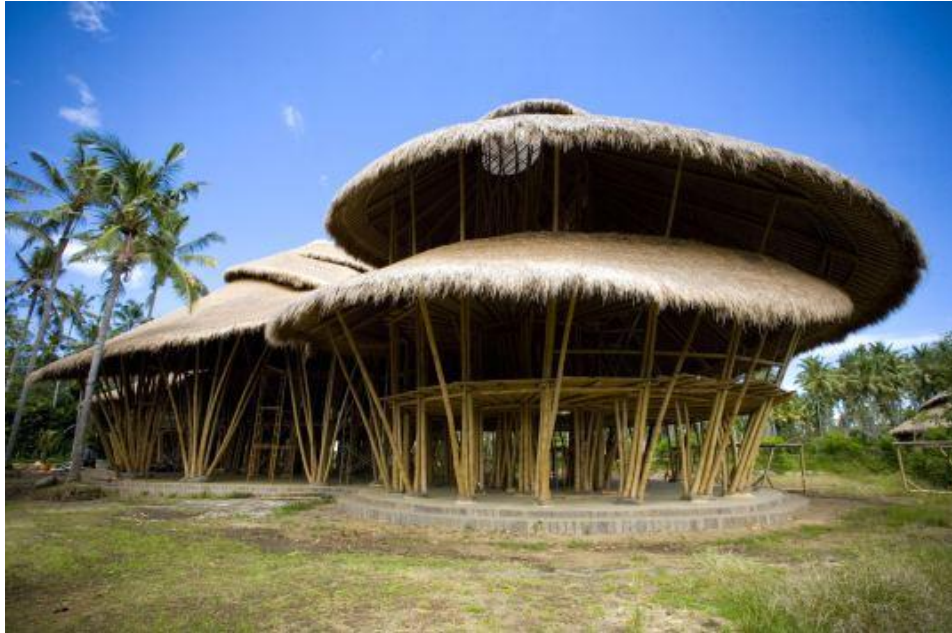
Pictures of the Green School classrooms, showcasing detailed bamboo based construction

Sustainable Procurement: Local communities are engaged in sustainable practices, utilizing traditional knowledge for harvesting and processing bamboo.