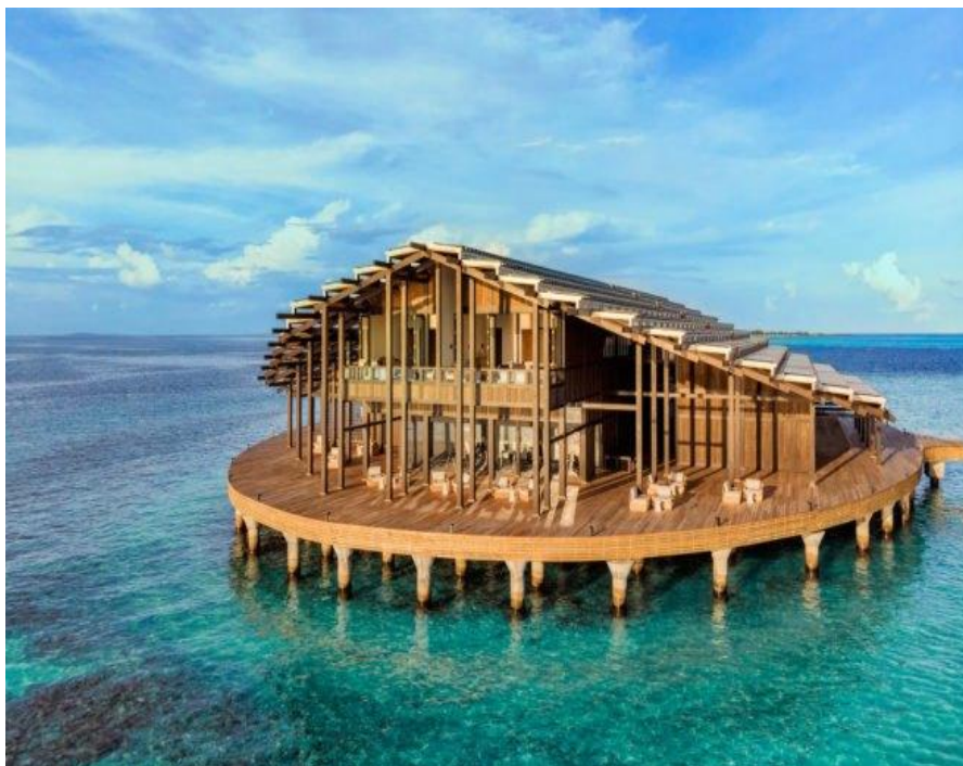
Photographs of floating resort in the Maldives with solar panels and modular wooden decks.

Adaptive Architecture: Structures are designed to be resilient to storm surges, utilizing materials like reinforced concrete and locally sourced coral stone for foundation stability.