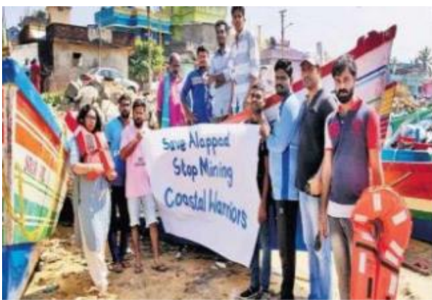
Figure 2: Save Alappad Campaign

The area of village has shrunk from 89.5 sq km to 7.6 sq km in 20 years. That means over 20,000 acres of land has been swallowed by the sea and if the mining continues, Alappad panchayat will be completely wiped off from the map. In 2004, roads to the site were blocked by protestors who demanded that the sea washing be stopped, sand be refilled, and scientific dredging be employed. This led to the closure of the sites for about 2 years. In 2011, there was another attempt to organise and streamline the protests against the mining companies through social media. Around 2017, these protests that were happening over many years were consolidated. The extremely popular social media campaign “#Save Alappad, Stop Mining” followed. The 10,000 fishermen who live in the village risk a loss of livelihood if Alappad goes under the sea and the negative impacts will be there in the nearby panchayats of Alappad i.e. Clappana, Kulasekharapuram and Karunagappally municipality which will get affected socially, economically and environmentally.