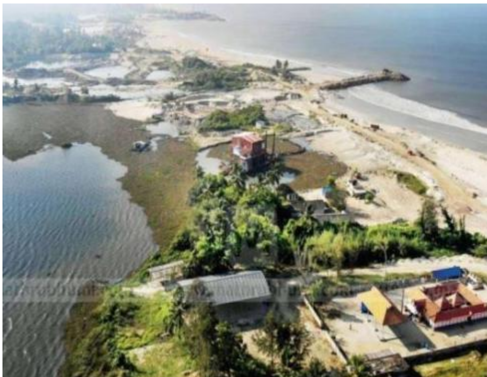
Figure 1: Alappad mining area

subsequently affects social sustainability too. The mining could have already done many damages beyond come back.. This was one of the most affected areas of the 2004 tsunami and the environmental degradation has further increased the vulnerability. Alappad which had an area of 89.5 sq km in 1955, has shrunk to just 7.6 sq km now. (Indian Rare Earths, 2018) The continuous mining of mineral sand by IREL over the past many years has submerged 20, 000 acres under the sea. Mining is continuing here in 82 acres. Today it risks being encroached by the sea and threatens to displace over many families off their land and livelihoods. Protest against the mining companies began with a fight for labour and land issues like better compensation for the land and employment in IREL in 1990's.