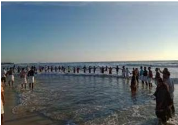
Figure 3: Villagers forming human chain

The area of village has shrunk from 89.5 sq km to 7.6 sq km in 20 years. That means over 20,000 acres of land has been swallowed by the sea and if the mining continues, Alappad panchayat will be completely wiped off from the map. In 2004, roads to the site were blocked by protestors who demanded that the sea washing be stopped, sand be refilled, and scientific dredging be employed. This led to the closure of the sites for about 2 years. In 2011, there was another attempt to organise and streamline the protests against the mining companies through social media. Around 2017, these protests that were happening over many years were consolidated. The extremely popular social media campaign