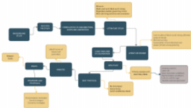
Figure 4: Methodology of the study

The study area includes Alappad panchayat and the nearby panchayats of Kulasekharapuram and Clappana and the Karunagappally municipality. The study area is 24 km north of Kollam and 60 km (37 mi) south of Alappuzha. It lies in the Karunagappally taluk. The taluk is bound on North by Kayamkulam, East by Kunnathur taluk, on the South by Kollam and on the west by Arabian sea.