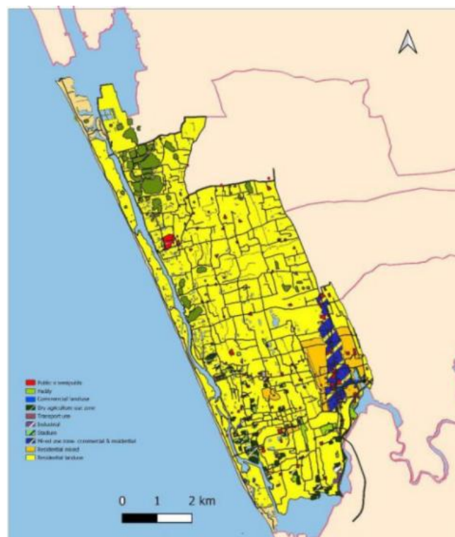
Figure 7: Land use of the study area

Residential land use is increasing at the cost of vacant land and paddy fields. When compared with other municipalities in the district, it is seen that Karunagappally has higher share of commercial activities and lowest share of industrial and agricultural activities. Alappad area has very less commercial land use. The residents depend upon the Karunagappally municipality for the shopping and all. No new development of commercial centres can be suggested in Alappad as the land is a narrow piece of land and also it falls under the CRZ III category. The land use for public and semi public places are also very less in Alappad panchayat.