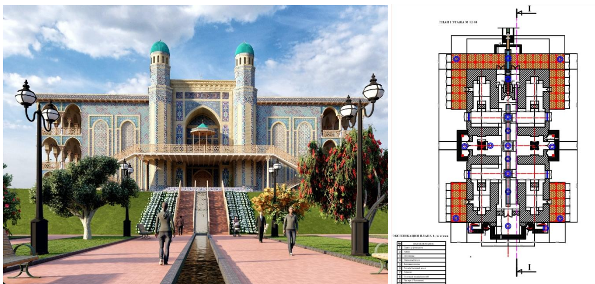
Figure 3: The project proposal by author for the revival of the 'Bagh-i Dilkusho' garden at its historical site.

Dilkusho' garden at its historical site, as part of the 'Eco-Tourism Mahalla Dilkusho' in the Sochak village, Taylak district of the Samarkand region (Fig.3)