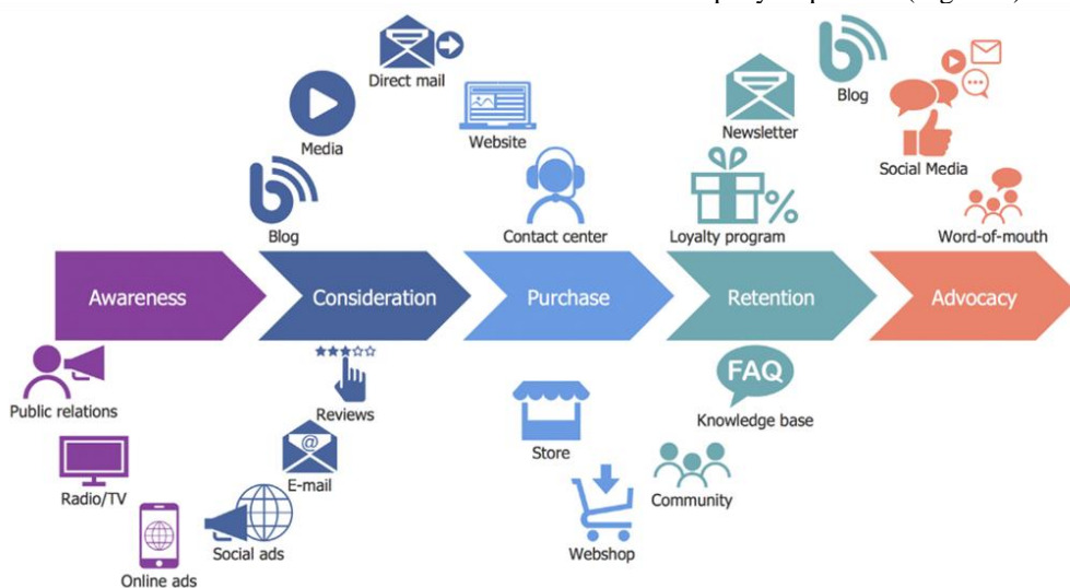
Figure 1: Contact points CJM [2]