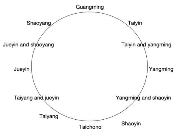
Figure 3: "The Kaihe Liuqi Acupuncture Method"

8) According to the theory of "Qi in the specimen", Jueyin and Yangming only have the characteristics of Zhongqi Shaoyang and Taiyin. We are not difficult to understand "the wind from the cremation, dry and wet". Jueyin and Yangming come to The same arc from the Yin and Yang fish eyes of the Taiji diagram with the other four qi, thus our "The Kaihe Liuqi Acupuncture Method diagram" is completed. (Figure 3 below)