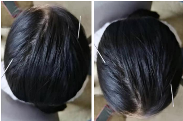
Figure 2: Head toward the sample